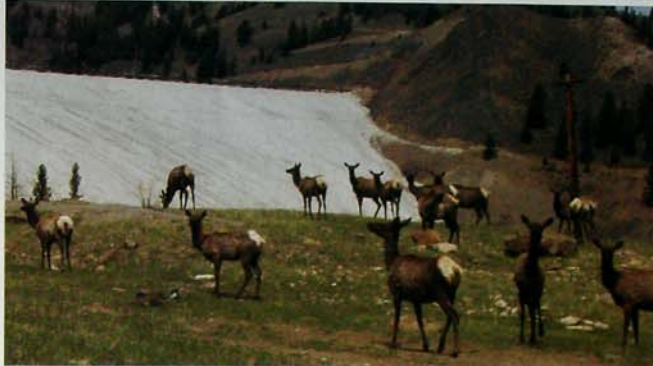
A herd of elk grazes on reclaimed tailings at Thompson Creek Mining's molybdenum mine in central Idaho.

tion projects completed in the last few years. Idaho star garnet gemstones are mined nearby.